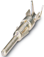
Crimp contact, rolled, Single contact, contact diameter: 1 mm, crimp range: 0.22 mm 2 ... 0.56 mm 2 , Single contact

Please be informed that the data shown in this PDF Document is generated from our Online Catalog. Please find the complete data in the user's documentation. Our General Terms of Use for Downloads are valid ( http://phoenixcontact.com/download )